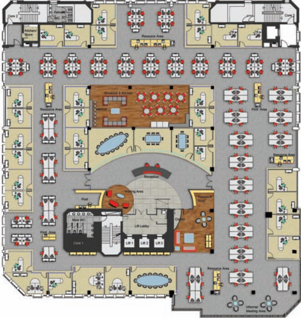
Proposed First Floor Split - Part Cellular